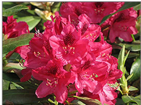
Nova Zembla Rhododendron flowers