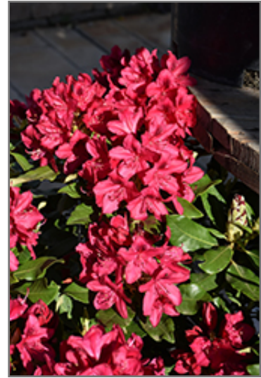
Nova Zembla Rhododendron flowers

This shrub does best in full sun to partial shade. You may want to keep it away from hot, dry locations that receive direct afternoon sun or which get reflected sunlight, such as against the south side of a white wall. It requires an evenly moist well-drained soil for optimal growth, but will die in standing water. It is very fussy about its soil conditions and must have rich, acidic soils to ensure success, and is subject to chlorosis (yellowing) of the foliage in alkaline soils. It is somewhat tolerant of urban pollution, and will benefit from being planted in a relatively sheltered location. Consider applying a thick mulch around the root zone in winter to protect it in exposed locations or colder microclimates. This particular variety is an interspecific hybrid.