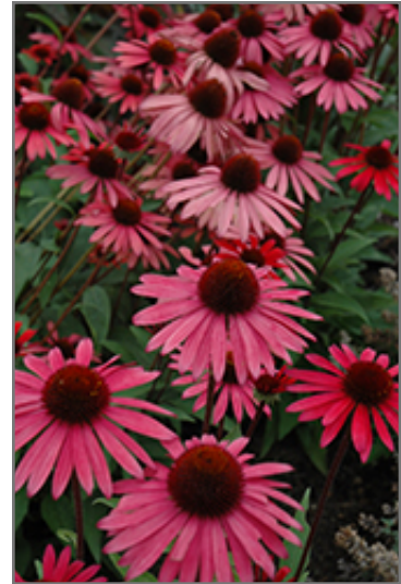
Big Sky Solar Flare Coneflower flowers

This is a relatively low maintenance plant, and is best cleaned up in early spring before it resumes active growth for the season. It is a good choice for attracting butterflies to your yard, but is not particularly attractive to deer who tend to leave it alone in favor of tastier treats. It has no significant negative characteristics.