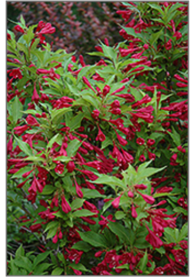
Red Prince Weigela flowers

This shrub should only be grown in full sunlight. It prefers to grow in average to moist conditions, and shouldn't be allowed to dry out. It is not particular as to soil type or pH. It is highly tolerant of urban pollution and will even thrive in inner city environments. This is a selected variety of a species not originally from North America.