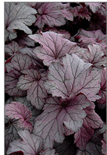
Spellbound Coral Bells foliage