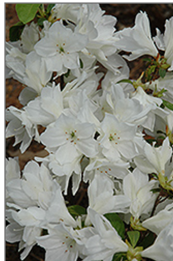
White Peacock Azalea flowers

White Peacock Azalea will grow to be about 4 feet tall at maturity, with a spread of 4 feet. It tends to be a little leggy, with a typical clearance of 1 foot from the ground. It grows at a slow rate, and under ideal conditions can be expected to live for 40 years or more.