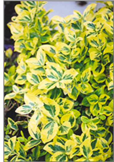
Sungold Wintercreeper foliage

Sungold Wintercreeper is recommended for the following landscape applications;