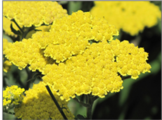
Moonshine Yarrow flowers