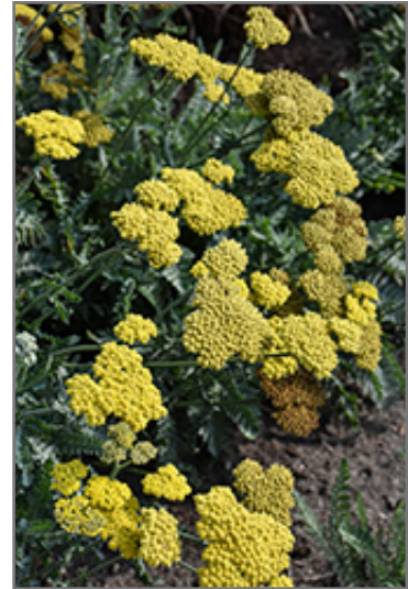
Moonshine Yarrow flowers

Moonshine Yarrow will grow to be about 24 inches tall at maturity, with a spread of 24 inches. It grows at a fast rate, and under ideal conditions can be expected to live for approximately 10 years. As an herbaceous perennial, this plant will usually die back to the crown each winter, and will regrow from the base each spring. Be careful not to disturb the crown in late winter when it may not be readily seen!