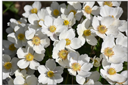
Windflower flowers