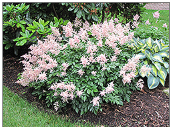
Peach Blossom Astilbe in bloom