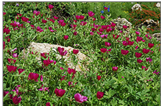
Buffalo Poppy flowers