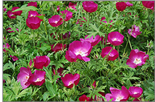
Buffalo Poppy flowers