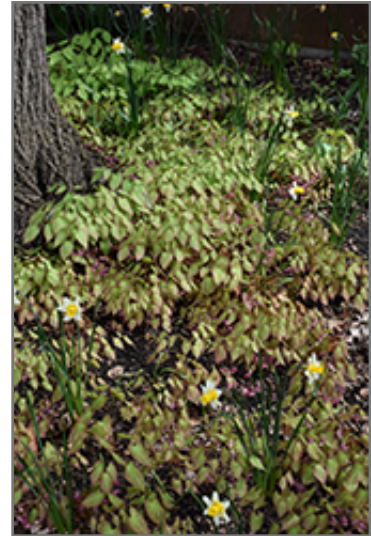
Bishop's Hat in bloom

Bishop's Hat is a fine choice for the garden, but it is also a good selection for planting in outdoor pots and containers. Because of its spreading habit of growth, it is ideally suited for use as a 'spiller' in the 'spiller-thriller-filler' container combination; plant it near the edges where it can spill gracefully over the pot. Note that when growing plants in outdoor containers and baskets, they may require more frequent waterings than they would in the yard or garden.