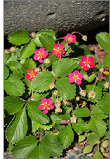
Lipstick Strawberry flowers

Lipstick Strawberry has masses of beautiful cherry red daisy flowers with yellow eyes along the stems from late spring to early summer, which are most effective when planted in groupings. Its tomentose round compound leaves remain green in color throughout the season. It features an abundance of magnificent red berries from mid spring to mid fall.