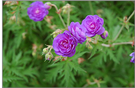
Double Cranesbill flowers