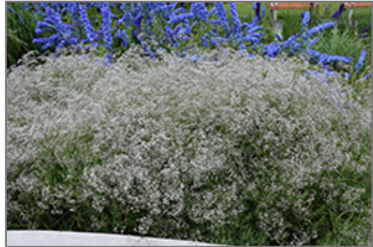
Common Baby's Breath in bloom