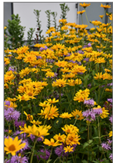
Summer Sun False Sunflower flowers