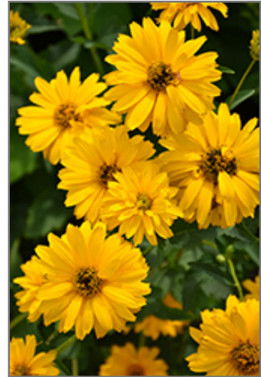
Summer Sun False Sunflower flowers

Summer Sun False Sunflower is recommended for the following landscape applications;