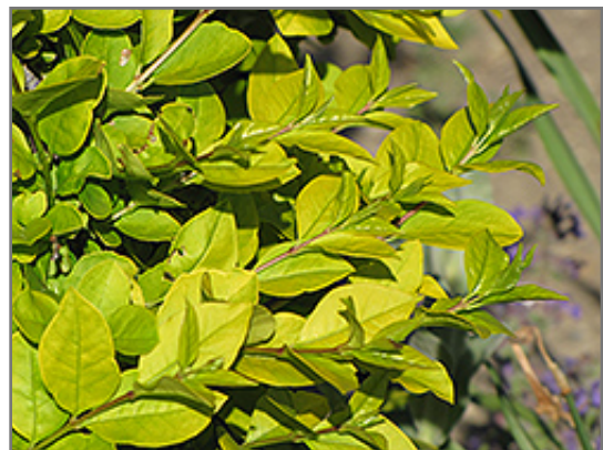
Golden Privet foliage