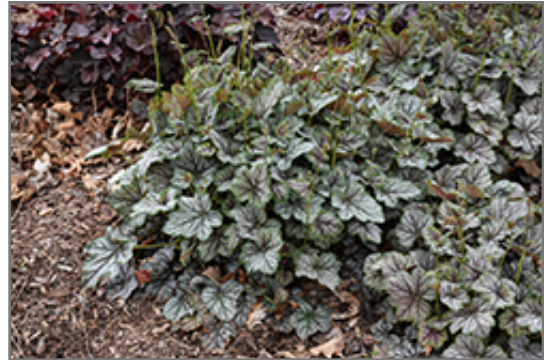
Green Spice Coral Bells

Green Spice Coral Bells is a fine choice for the garden, but it is also a good selection for planting in outdoor pots and containers. With its upright habit of growth, it is best suited for use as a 'thriller' in the 'spiller-thriller-filler' container combination; plant it near the center of the pot, surrounded by smaller plants and those that spill over the edges. Note that when growing plants in outdoor containers and baskets, they may require more frequent waterings than they would in the yard or garden.