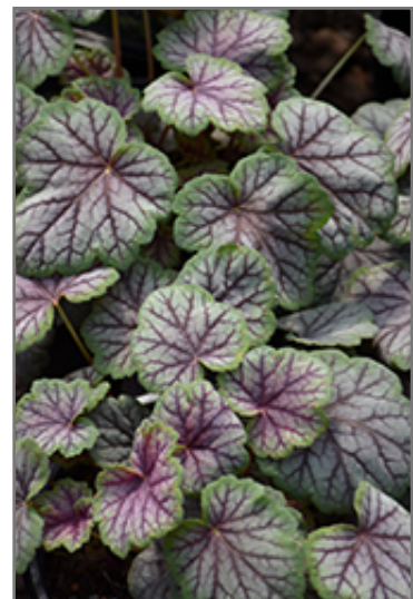
Green Spice Coral Bells foliage