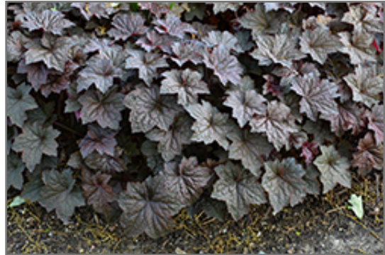
Palace Purple Coral Bells

Palace Purple Coral Bells is a fine choice for the garden, but it is also a good selection for planting in outdoor pots and containers. With its upright habit of growth, it is best suited for use as a 'thriller' in the 'spiller-thriller-filler' container combination; plant it near the center of the pot, surrounded by smaller plants and those that spill over the edges. Note that when growing plants in outdoor containers and baskets, they may require more frequent waterings than they would in the yard or garden.