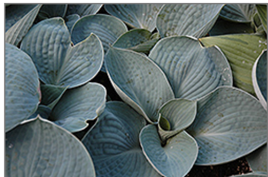
Love Pat Hosta foliage