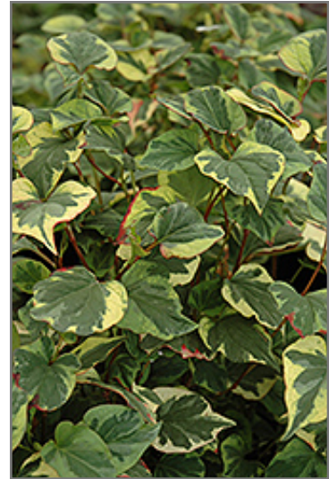
Variegated Chameleon Plant foliage