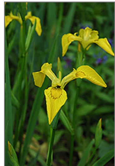
Yellow Flag Iris flowers