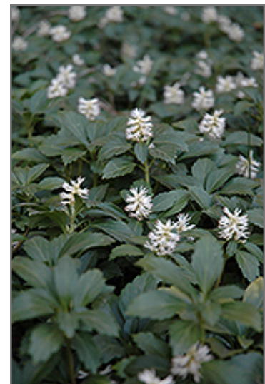
Japanese Spurge flowers