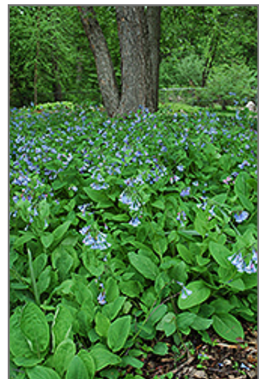
Virginia Bluebells in bloom