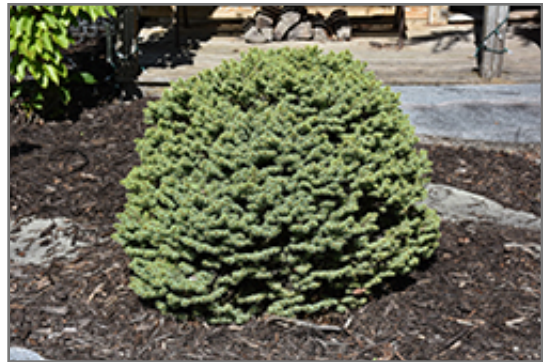
Dwarf Serbian Spruce