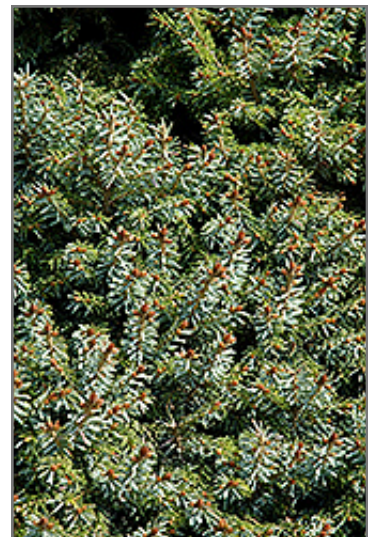
Dwarf Serbian Spruce foliage