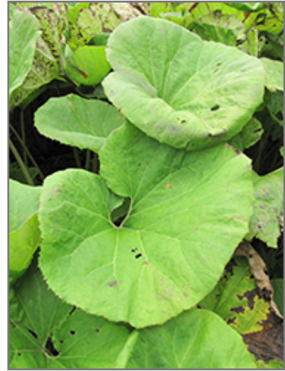
Giant Japanese Butterbur foliage

Giant Japanese Butterbur is recommended for the following landscape applications;