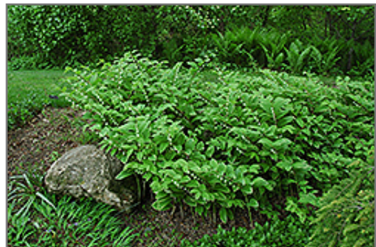
Variegated Solomon's Seal in bloom