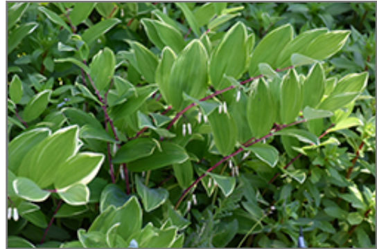
Variegated Solomon's Seal flowers