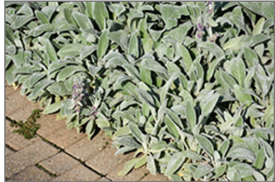
Lamb's Ears

Lamb's Ears will grow to be about 12 inches tall at maturity extending to 24 inches tall with the flowers, with a spread of 18 inches. When grown in masses or used as a bedding plant, individual plants should be spaced approximately 15 inches apart. Its foliage tends to remain dense right to the ground, not requiring facer plants in front. It grows at a fast rate, and under ideal conditions can be expected to live for approximately 10 years. As an herbaceous perennial, this plant will usually die back to the crown each winter, and will regrow from the base each spring. Be careful not to disturb the crown in late winter when it may not be readily seen!