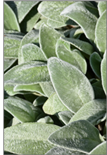
Lamb's Ears foliage

Lamb's Ears is recommended for the following landscape applications;