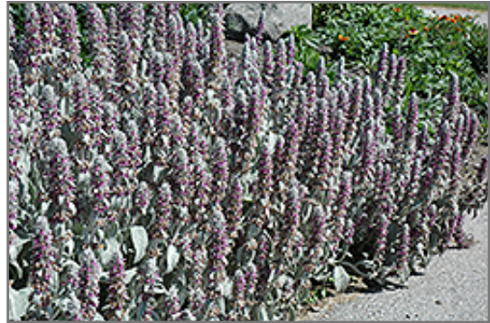
Lamb's Ears in bloom

Lamb's Ears will grow to be about 12 inches tall at maturity extending to 24 inches tall with the flowers, with a spread of 18 inches. When grown in masses or used as a bedding plant, individual plants should be spaced approximately 15 inches apart. Its foliage tends to remain dense right to the ground, not requiring facer plants in front. It grows at a fast rate, and under ideal conditions can be expected to live for approximately 10 years. As an herbaceous perennial, this plant will usually die back to the crown each winter, and will regrow from the base each spring. Be careful not to disturb the crown in late winter when it may not be readily seen!