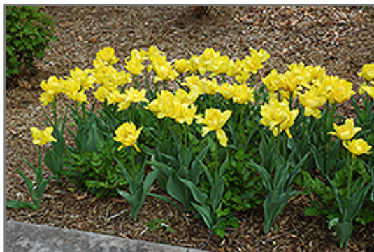
Monte Carlo Tulip in bloom