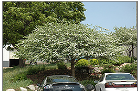
Thornless Cockspur Hawthorn in bloom