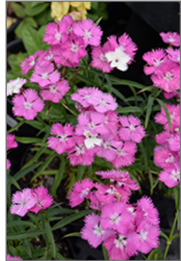
First Love Pinks flowers

First Love Pinks is recommended for the following landscape applications;