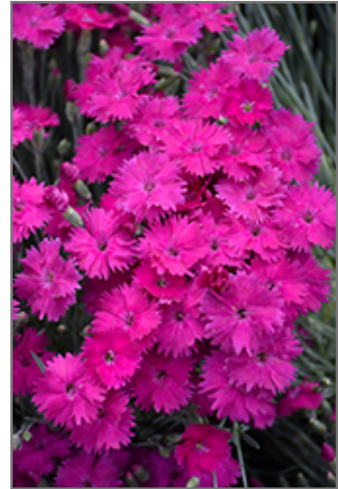
Neon Star Pinks flowers

This is a relatively low maintenance plant, and is best cleaned up in early spring before it resumes active growth for the season. It is a good choice for attracting bees and butterflies to your yard, but is not particularly attractive to deer who tend to leave it alone in favor of tastier treats. It has no significant negative characteristics.