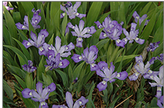
Dwarf Crested Iris flowers

Dwarf Crested Iris is recommended for the following landscape applications;