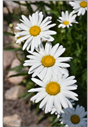
Silver Princess Shasta Daisy flowers