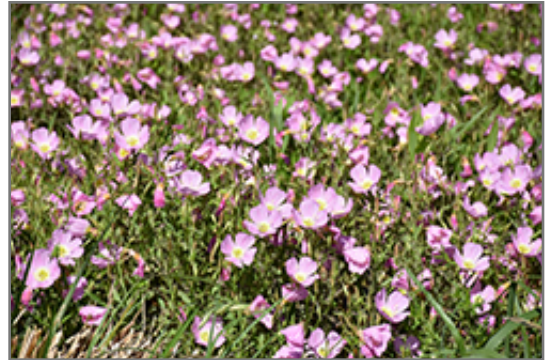
Evening Primrose flowers

This plant should only be grown in full sunlight. It prefers dry to average moisture levels with very well-drained soil, and will often die in standing water. It is considered to be drought-tolerant, and thus makes an ideal choice for a low-water garden or xeriscape application. It is not particular as to soil type or pH. It is somewhat tolerant of urban pollution. This species is native to parts of North America. It can be propagated by division.