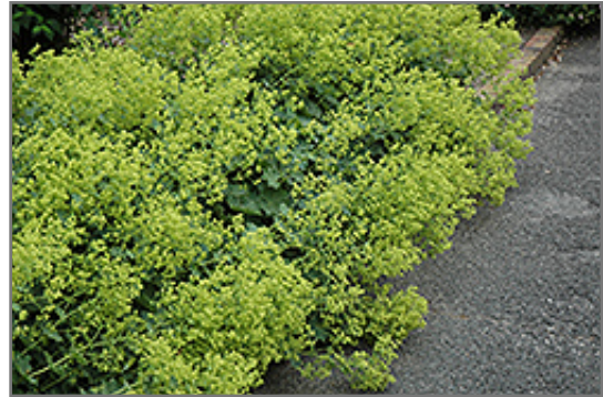
Thriller Lady's Mantle in bloom

Thriller Lady's Mantle is recommended for the following landscape applications;