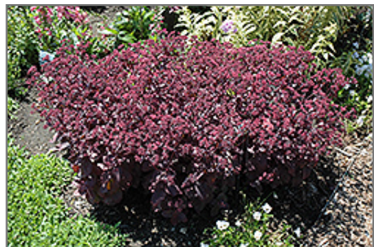
Xenox Stonecrop in bloom