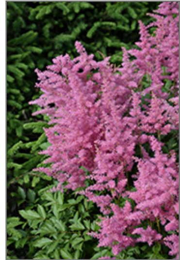
Visions in Pink Chinese Astilbe flowers

Visions in Pink Chinese Astilbe is recommended for the following landscape applications;