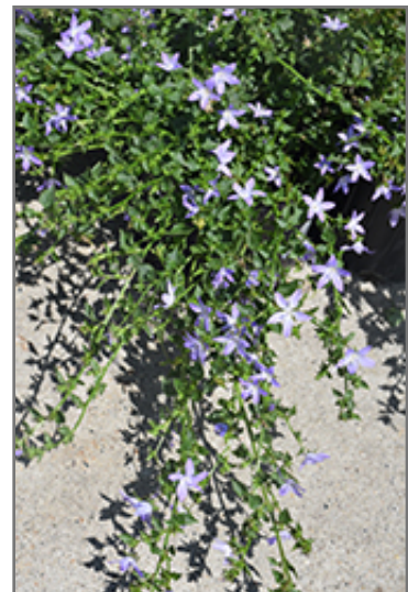
Blue Waterfall Serbian Bellflower in bloom