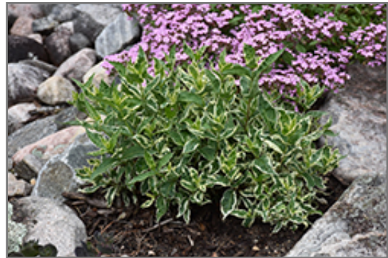
Cool Splash Bush Honeysuckle