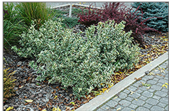
Cool Splash Bush Honeysuckle