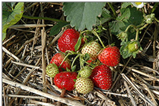
Everbearing Strawberry fruit

Everbearing Strawberry features dainty white daisy flowers with yellow eyes along the stems from late spring to early summer. Its tomentose round compound leaves remain green in color throughout the season. It features an abundance of magnificent cherry red berries from early to late summer.