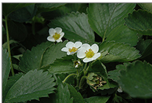
Everbearing Strawberry flowers