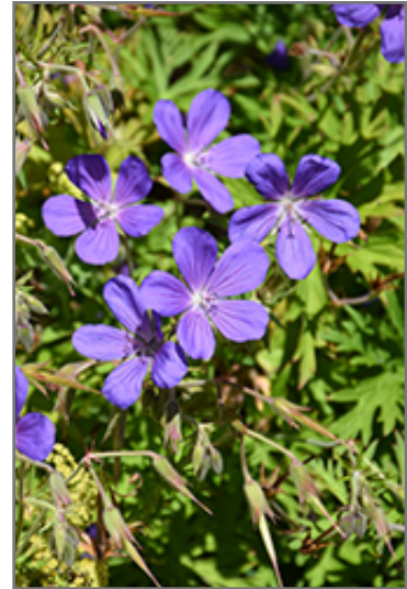
Orion Cranesbill flowers