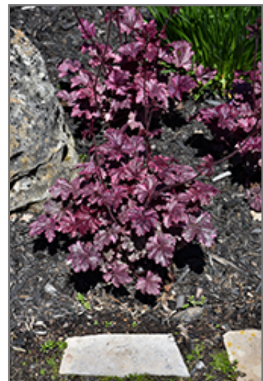
Midnight Rose Coral Bells