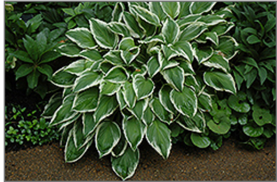
So Sweet Hosta

This plant does best in partial shade to shade. It prefers to grow in average to moist conditions, and shouldn't be allowed to dry out. It is not particular as to soil type or pH. It is somewhat tolerant of urban pollution. This particular variety is an interspecific hybrid. It can be propagated by division; however, as a cultivated variety, be aware that it may be subject to certain restrictions or prohibitions on propagation.