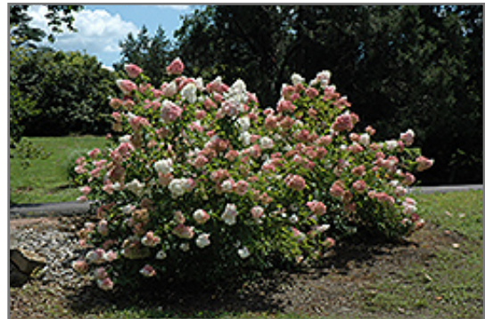
Vanilla Strawberry Hydrangea in bloom