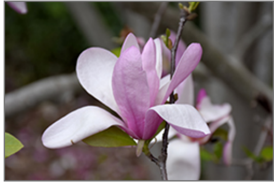
Jane Magnolia flowers

This shrub does best in full sun to partial shade. It requires an evenly moist well-drained soil for optimal growth, but will die in standing water. It is not particular as to soil type, but has a definite preference for acidic soils. It is quite intolerant of urban pollution, therefore inner city or urban streetside plantings are best avoided. Consider applying a thick mulch around the root zone in winter to protect it in exposed locations or colder microclimates. This particular variety is an interspecific hybrid.