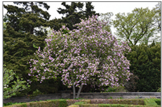
Jane Magnolia in bloom