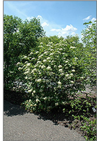
Witherod Viburnum in bloom