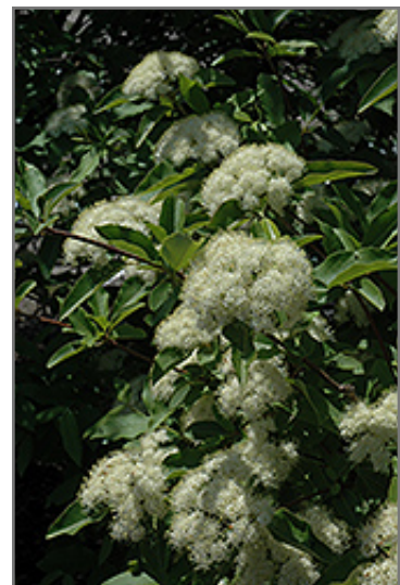
Witherod Viburnum flowers