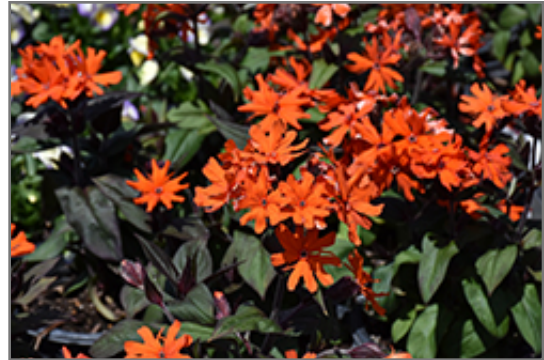
Orange Gnome Campion flowers

Orange Gnome Campion is recommended for the following landscape applications;