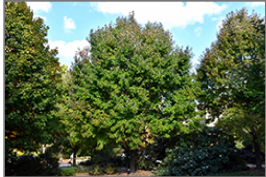
Autumn Flame Red Maple

This tree should only be grown in full sunlight. It is quite adaptable, preferring to grow in average to wet conditions, and will even tolerate some standing water. It is not particular as to soil type, but has a definite preference for acidic soils, and is subject to chlorosis (yellowing) of the foliage in alkaline soils. It is somewhat tolerant of urban pollution. This is a selection of a native North American species.