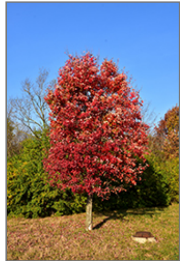
Autumn Flame Red Maple in fall

Autumn Flame Red Maple is recommended for the following landscape applications;