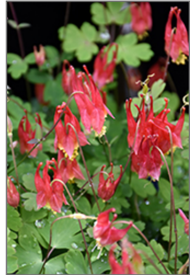
Little Lanterns Columbine flowers

Little Lanterns Columbine is a fine choice for the garden, but it is also a good selection for planting in outdoor pots and containers. It is often used as a 'filler' in the 'spiller-thriller-filler' container combination, providing a mass of flowers and foliage against which the larger thriller plants stand out. Note that when growing plants in outdoor containers and baskets, they may require more frequent waterings than they would in the yard or garden.