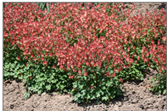
Little Lanterns Columbine in bloom