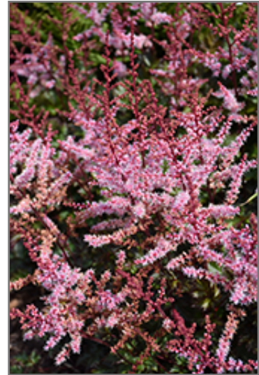
Delft Lace Astilbe flowers

This is a relatively low maintenance plant, and is best cleaned up in early spring before it resumes active growth for the season. It is a good choice for attracting butterflies to your yard, but is not particularly attractive to deer who tend to leave it alone in favor of tastier treats. It has no significant negative characteristics.